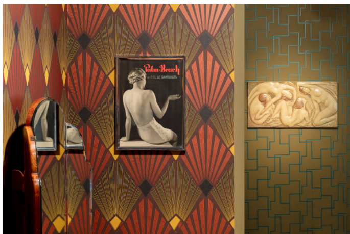
Echoes of Art Deco © Silvia Cappellari