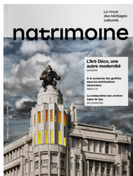
"L'Art Déco, une autre modernité" (Natrimoine n°10)