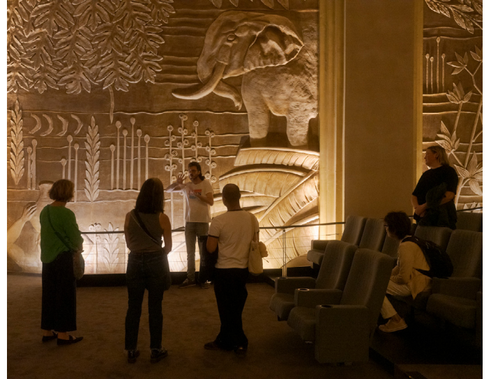
Heritage Days 2025. The historic main auditorium of the Eldorado cinema

This increased accessibility was reflected in the development of the Art Nouveau Pass, which became the Art Nouveau Art Deco Pass, incorporating several Art Deco venues in addition to the Art Nouveau sites. In 2025, 6.949 passes were sold and scanned 12.840 times , confirming the public's interest in a combined experience and the discovery of emblematic sites throughout the Region.