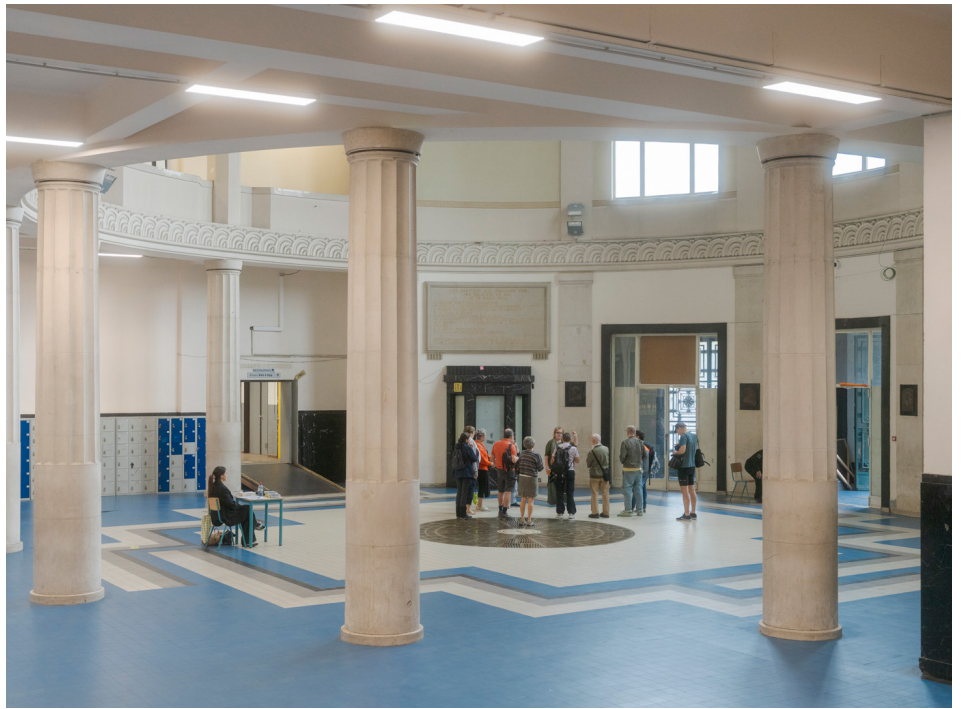
Heritage Days 2025, Institut des Arts et Métiers, Jonathan Ortegat © urban.brussels

partners involved, including museums, cultural institutions, guide associations, embassies, Brussels municipalities and publishers.