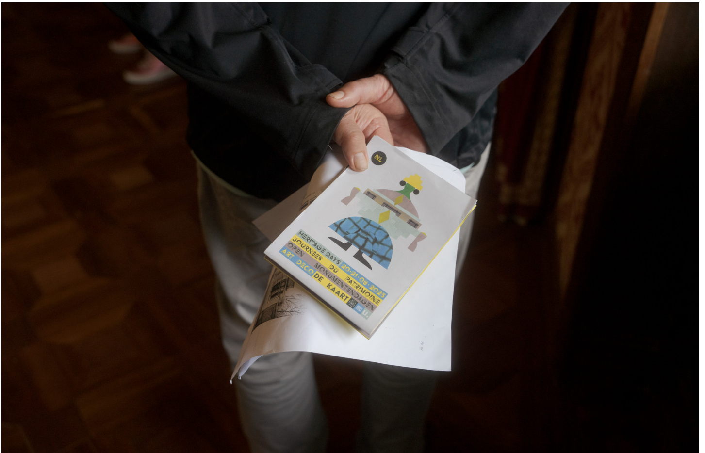
Heritage Days 2025 program brochure, Jonathan Ortegat © urban.brussels