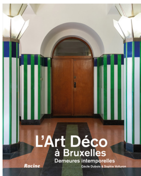
"L'Art Déco à Bruxelles - Demeures intemporelles" (Editions Racine)

As a retrospective of this rich Art Deco Year, Urban will dedicate the 40th issue of its "Bruxelles Patrimoines/Erfgoed Brussel" magazine entirely to this style. This is set to be published in early 2026. The themes addressed include the major challenges posed by the restoration of two protected giants: the Palais de la Folle Chanson in Ixelles and the Pavillons français in Schaerbeek.