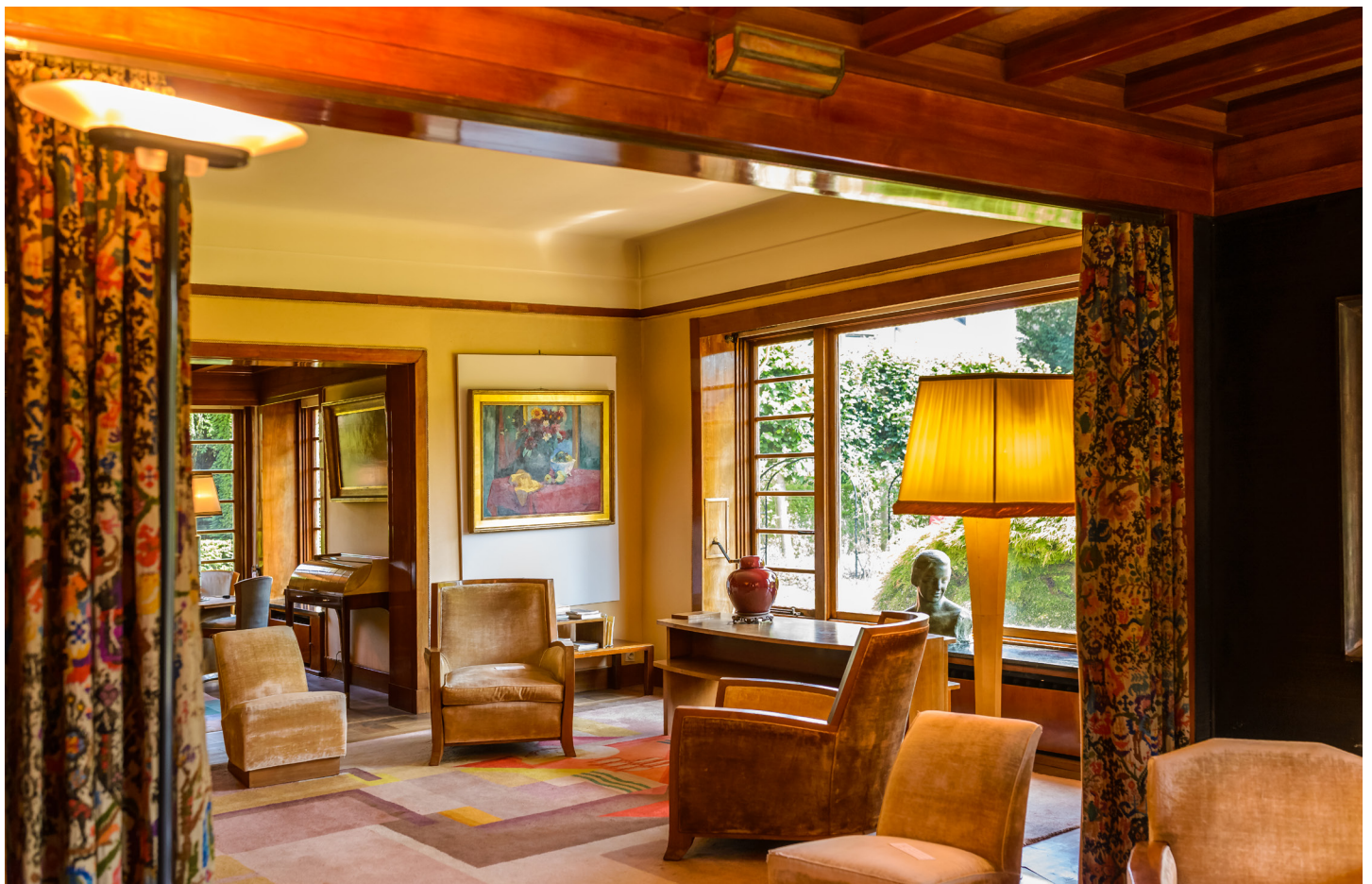
Van Buuren Museum & Gardens

Through their scope and local roots, these activities have ensured a balanced distribution of the programme across the region, helping to broaden audiences and strengthen cooperation between cultural operators, associations and local authorities.