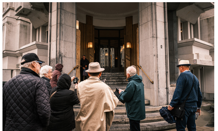
Brussels Post-Congress Art Deco 2025, Église Saint-Augustin

Lecture "La petite histoire d'une grande maison gantoise, la Compagnie Chantal "