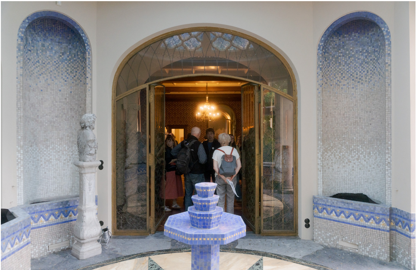
Heritage Days 2025, Pelgrims House, Jonathan Ortegat © urban.brussels