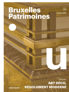
Bruxelles Patrimoines n°40 "Art Déco, résolument moderne" urban.brussels (available soon)