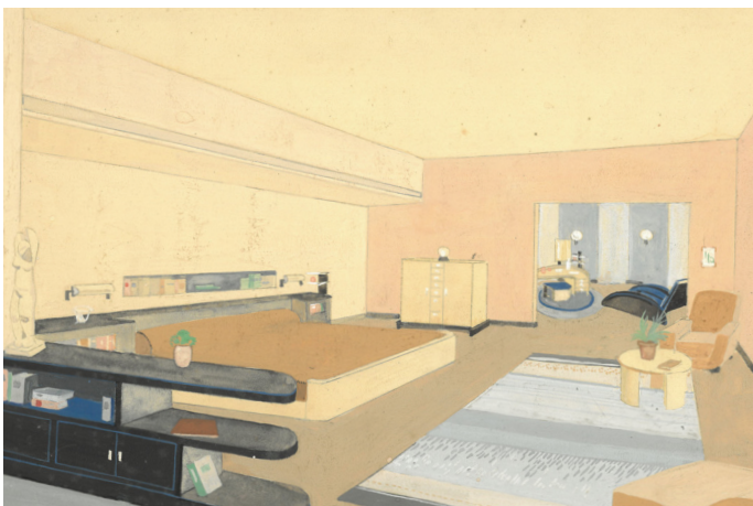
Baucher Feron © Design Museum Brussels